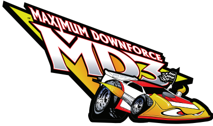
Left Side Orientation