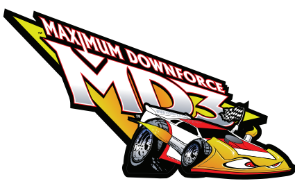
Right Side Orientation