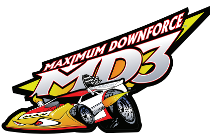
Left Side Orientation